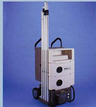
VersaTile™ Wall & Acoustical Tile Cleaning System