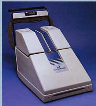
VS Mach 12 High Speed Extraction System