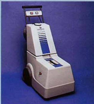
LMX Low Moisture Soil Extraction Carpet Cleaning System