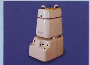
Dolphin™ Robotic Carpet Maintenance System