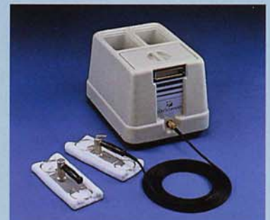
VS3 "Sanitizing Machine" Power Wall Cleaning System